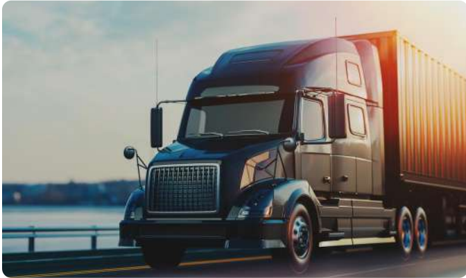
Ensuring Pharma Logistics Vitality Through Temperature Control