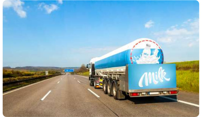
Quality and Safety in Dairy Distribution with Temperature Monitoring