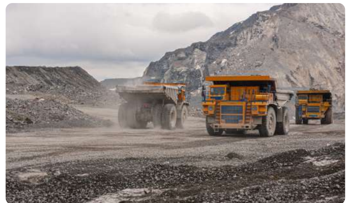
Safety and Efficiency in Mining Operations through Tire Management