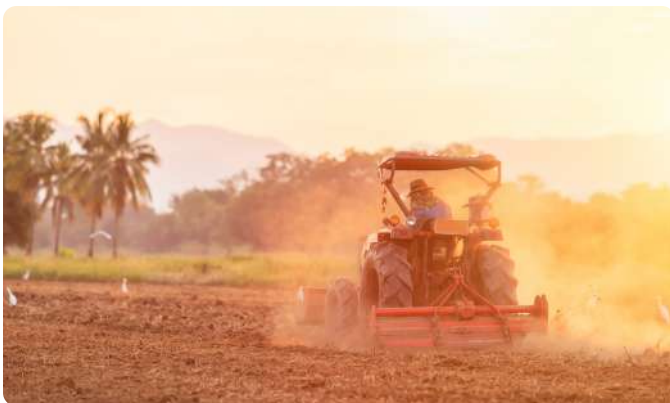
Enhancing Agricultural Efficiency and Productivity Tire Management