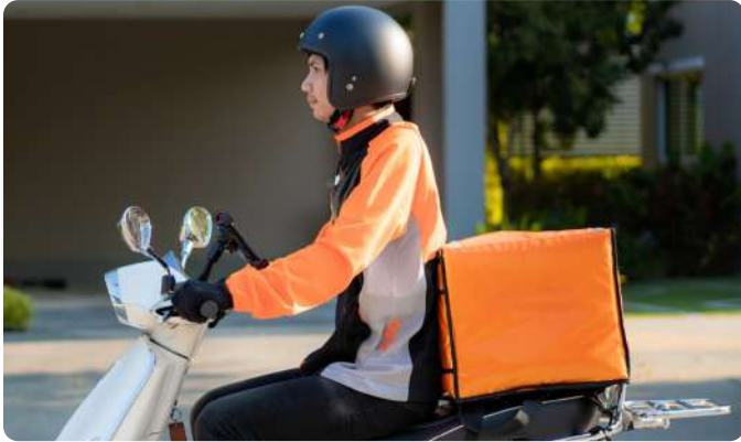
Delivering Success: How Route Optimization Revolutionizes Food Delivery