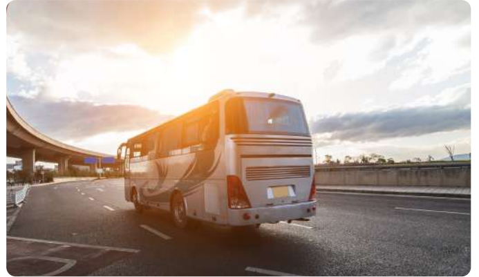
Efficient Employee Transport through Route Optimization