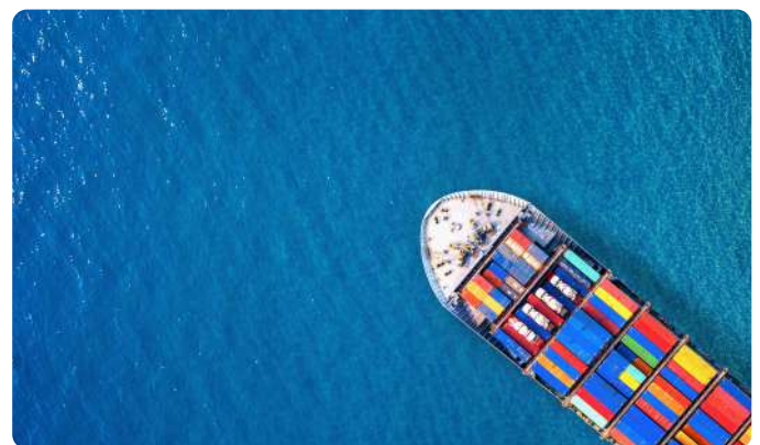
Tracking and Monitoring Fuel for Marine Fleet