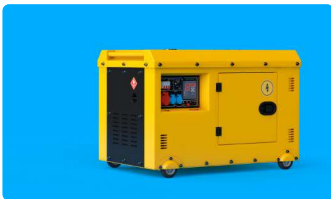
Optimizing Diesel Generator Operations with Fuel Management Software